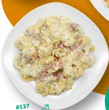
#137 Tortellini »Panna«